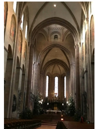
Cathedral of St. Martin, Mainz

Thank you for your love and the opportunity to serve you!