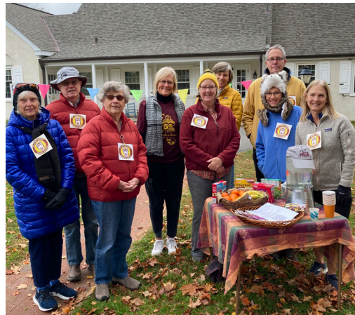
The early arrivals hydrated and boosted their energy before taking off at 9:30 a.m.