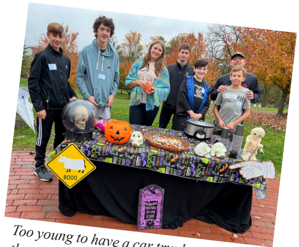
Too young to have a car trunk to decorate, the youth group improvised with a table!