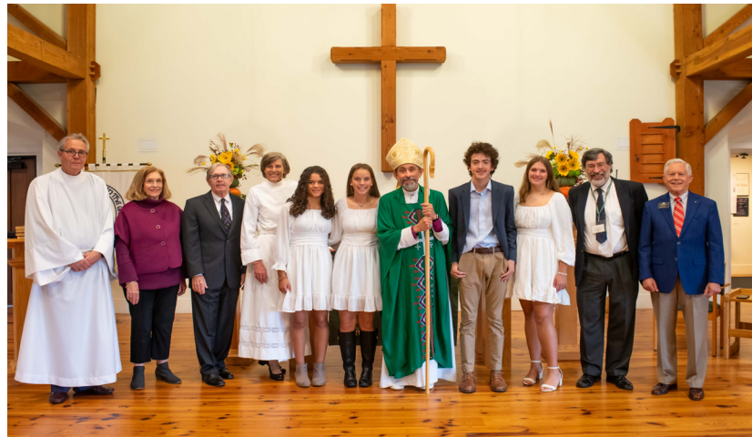
The Bishop confirmed four young people and one adult and blessed five adults who reaffirmed their faith. And he energetically shared the peace with the congregation gathered that day.